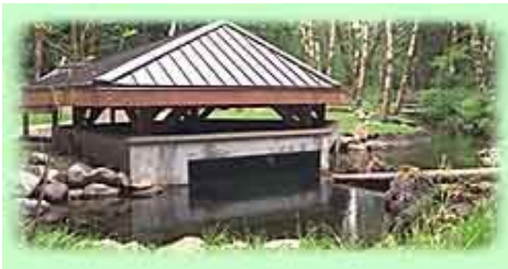
Wildwood Recreation Site