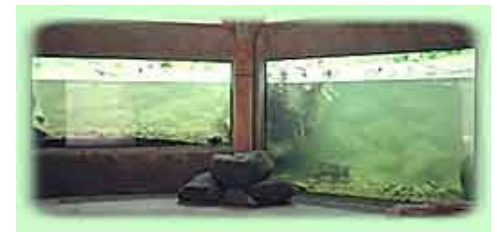
underwater viewing chamber